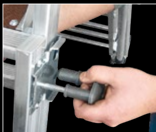
Height adjustment thanks to ergonomic handles on both sides