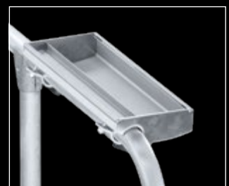
Optional storage tray, order no. 40062

Flexible working height thanks to the double-depth tread under the platform.