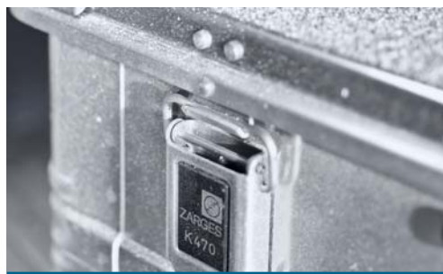
Dust-tight to standard IP 65