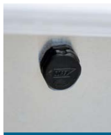
Automatic pressure relief valve with compensation membrane