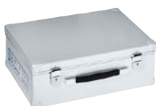
Alu-Case K 410 – GGV

In most cases, our extensive range of standard products offers a wide variety of solutions that meet our customers' requirements. Here is a selection of some of our most popular product series: