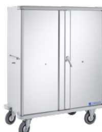
Cupboard trolley W105N