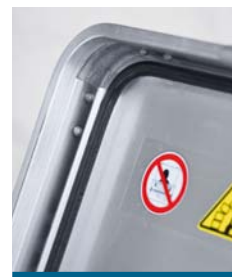
Lid with all-round foamed seal