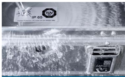
Protected against water jets