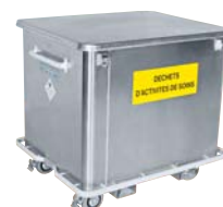
Reusable transportation container UN 3291